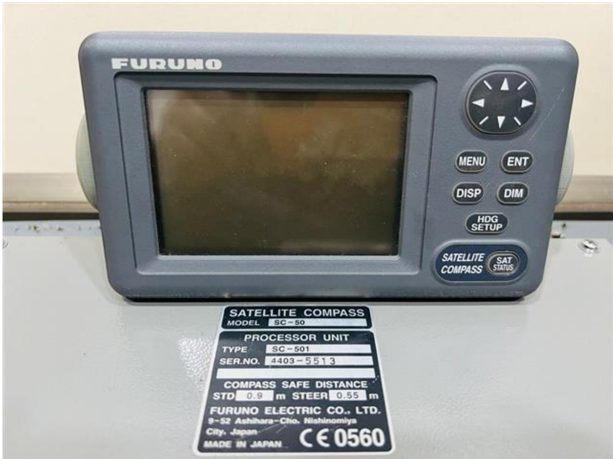
EQUIPMENT LIST DATED 16.11.2024