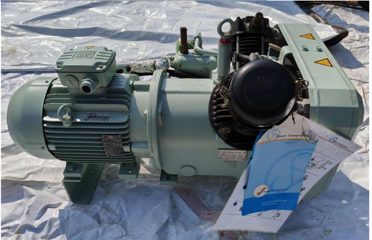
EQUIPMENT LIST DATED 17.03.2025